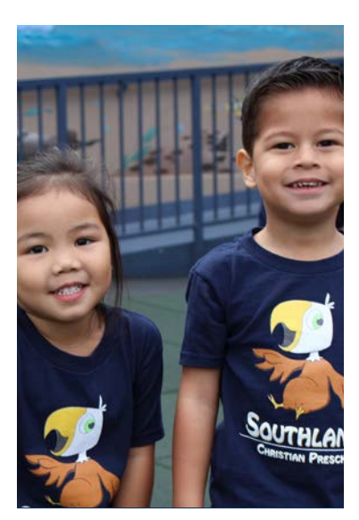
PRESCHOOL CURRICULUM ABEKA & LITTLE TREASURES