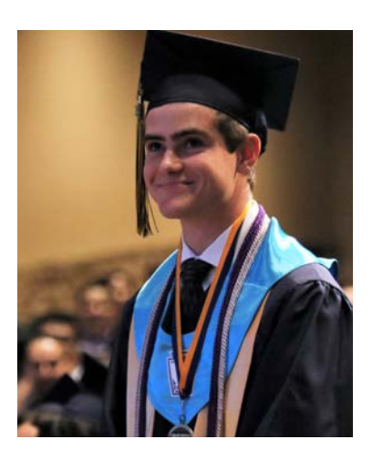
HIGH SCHOOL 100/0 COLLEGE ACCEPTANCE RATE