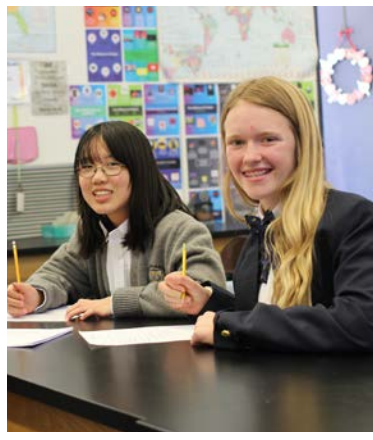
TOP CHRISTIAN HIGH SCHOOL IN CALIFORNIA