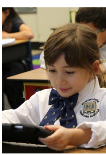
NICHE A+ RATING