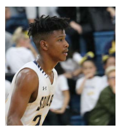
80% ATHLETIC PROGRAMS QUALIFIED FOR C.I.F. PLAYOFFS WITHIN THE LAST 3 YEARS